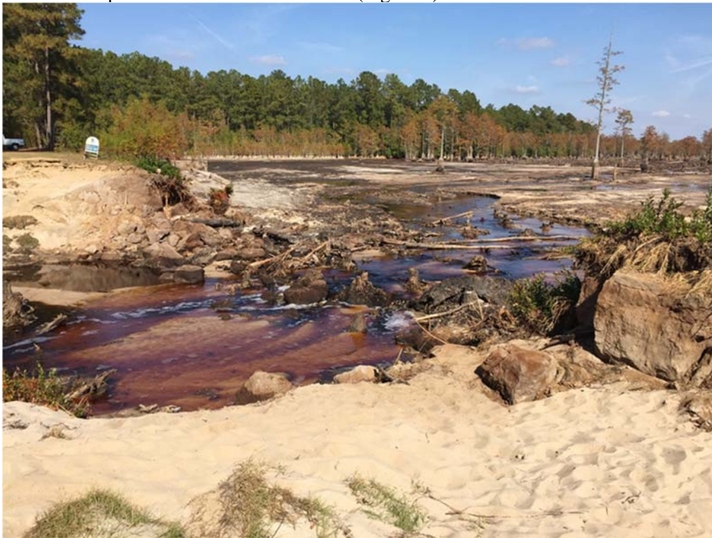
Figure 4: Jessup Mill Pond/Smith Lake Dam breach

An overview of FEMA's Public Assistance (PA) relating to dams is provided with information on a site visit to Jessup Mill Pond/Smith Lake Dam (Figure 4).