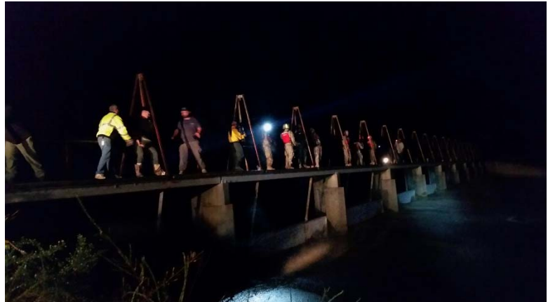
Figure 3: National Guard and others placing sandbags at Woodlake Dam (NC DEMLR)