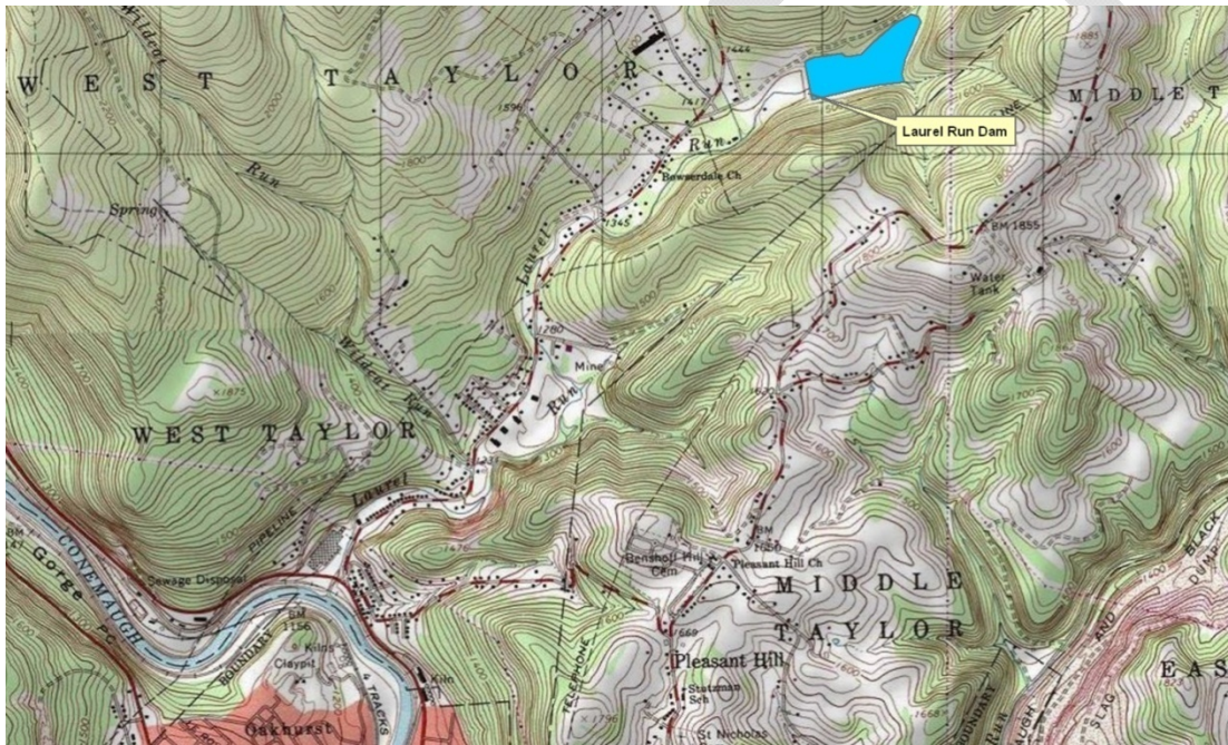
Laurel Run Dam location map