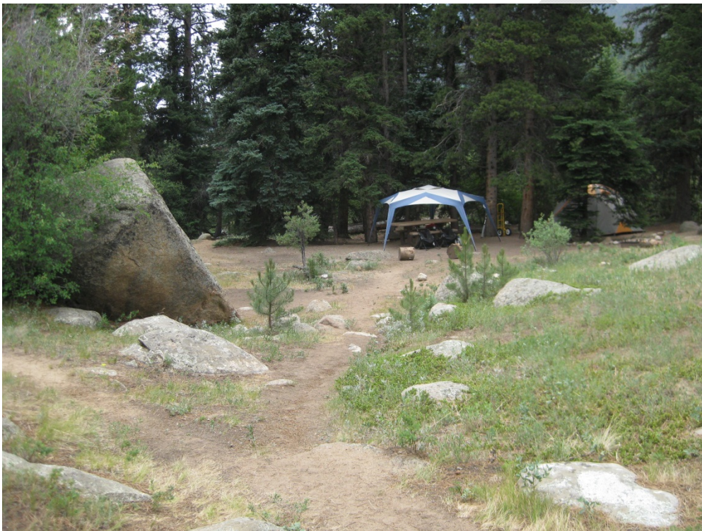
Aspenglen Campground site near where two fatalities occurred.

Note that downstream of Estes Park is the location of the Big Thompson flood which occurred six years earlier in 1976. The Big Thompson flood was a flash flood event which killed 144 people and did extensive damage to developed areas of the Big Thompson Canyon and the city of Loveland, Colorado. Recent memory of this event may have been one reason why the emergency response and evacuation efforts were so successful along the Fall River and in the town of Estes Park.