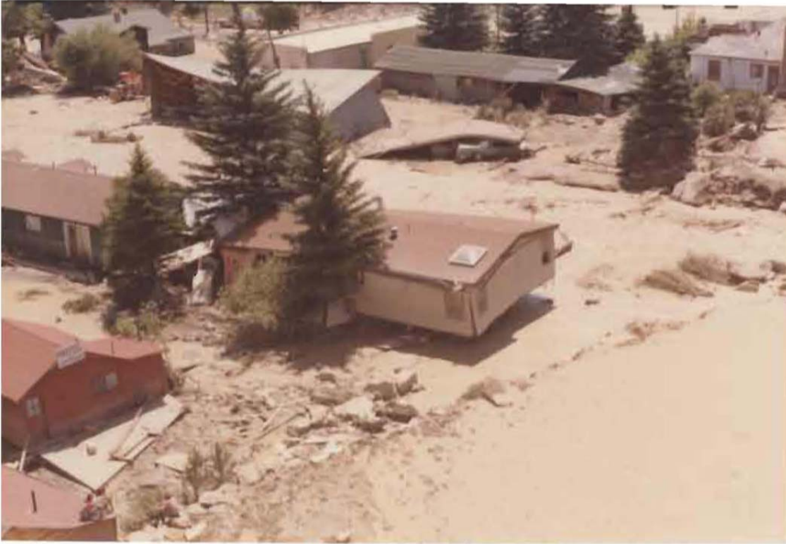
Flood damage at Estes Park Source: Wayne Graham, Reclamation, taken July 15, 1982