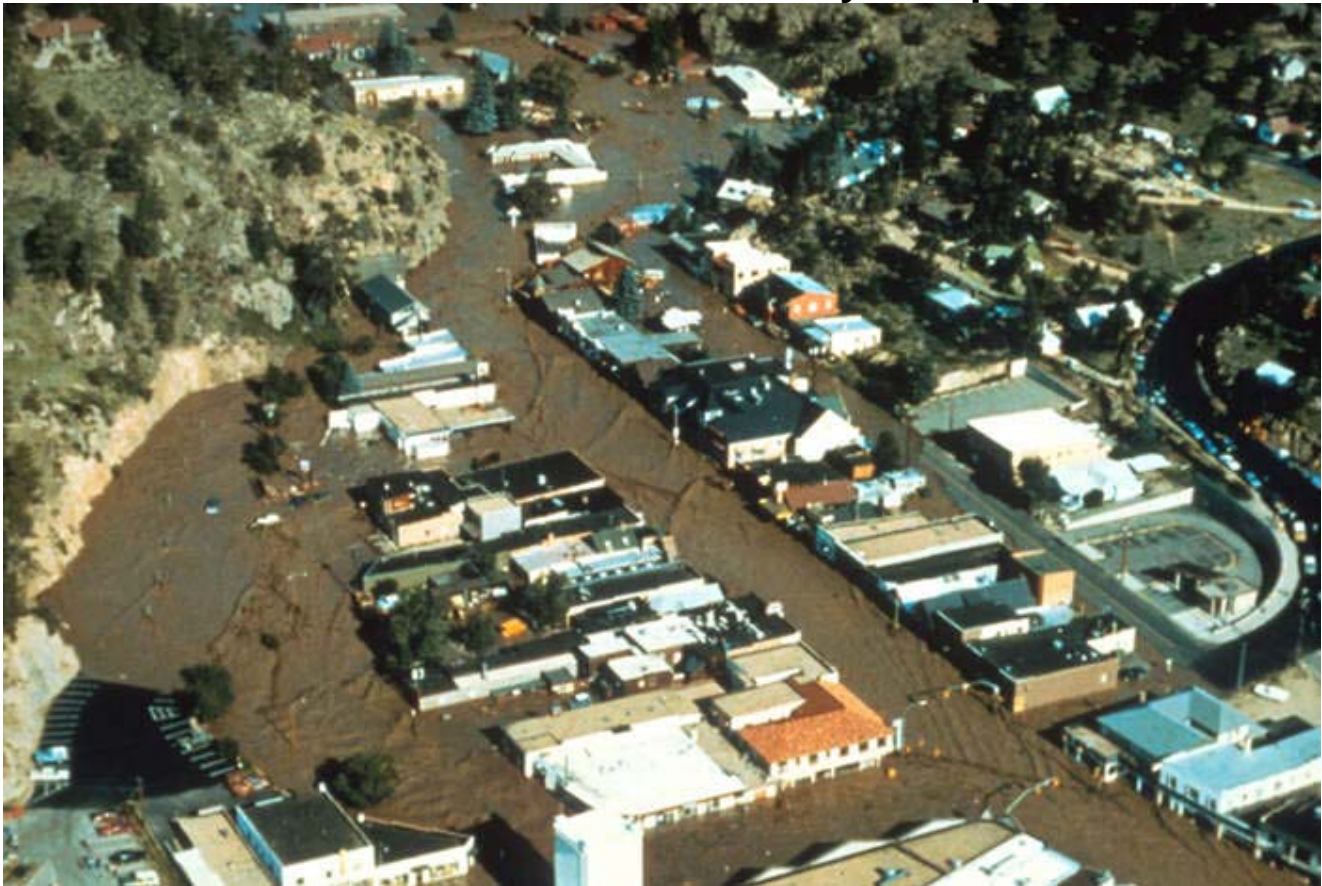
Lawn Lake Dam failure flood in 1982 at Estes Park, CO