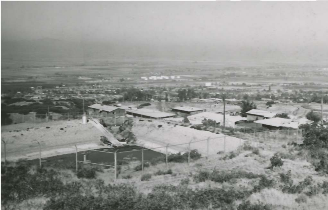
Breached Reservoir No.1 Dam

Reservoir No.1, located near Bountiful, Utah, failed on Sunday September 24, 1961 at 4:30 am. The earthen dam, which created a bathtub reservoir, was two years old when it failed from what was thought to be internal erosion. The exact height of the dam is not known, although available photographs indicate the dam height was in the range of about 15 feet. A total of 4.4 acre-feet of storage was reportedly released from the breach and the reservoir emptied in less than fifteen minutes. Failure of the dam was not detected prior to its occurrence and no warning was issued. The flood resulted in damage to about twenty properties which were damaged, but not destroyed, and there was an affected population at risk (PAR) of maybe eighty people. This event did not result in any fatalities.