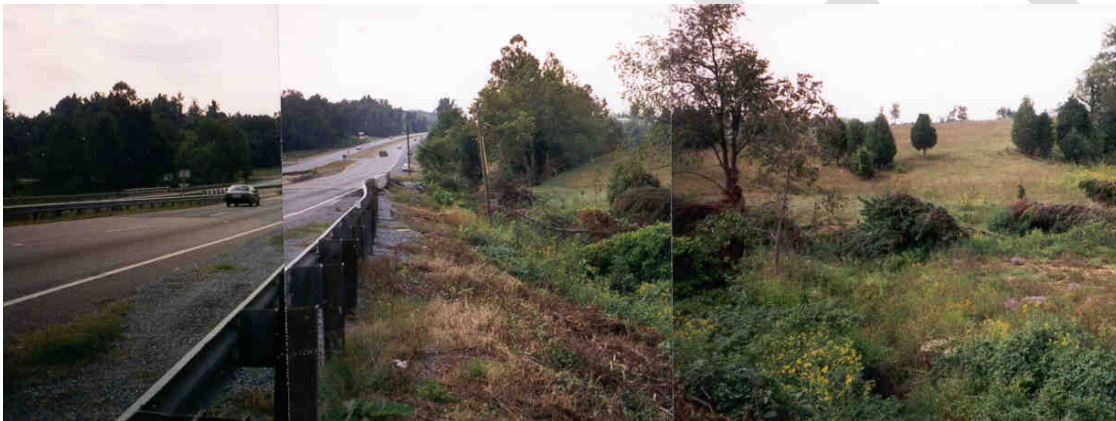
Location where rescue worker was killed

Timberlake Dam was rebuilt about one year after its failure.