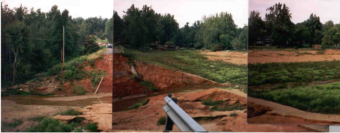
The breached Timberlake Dam

the streams that leads into Timber Lake. Water rose over the hood and was inching higher when some neighbors tied a life jacket to a rope and pulled him to safety. The dam failed before he was able to reach the dam.