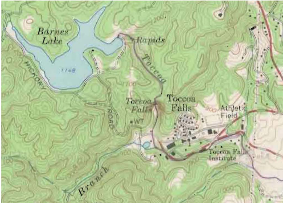
Kelly Barnes Dam location map

Further downstream, a wood frame garage and maintenance building were partially demolished by water impact. A trailer park on the right flood plain near the garage was demolished. Debris marks in this area indicate that the water depth was about 10 feet. Some of the trailers floated away, others were smashed. Most of the fatalities were to the occupants of this trailer village. The flood velocity at this point was great enough to carry a large inter-city bus nearly one-half mile downstream. (USCOLD 1977)