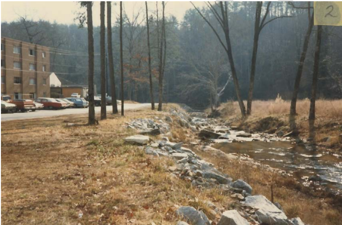
Forest Hall Dormitory on left, Toccoa Creek on right