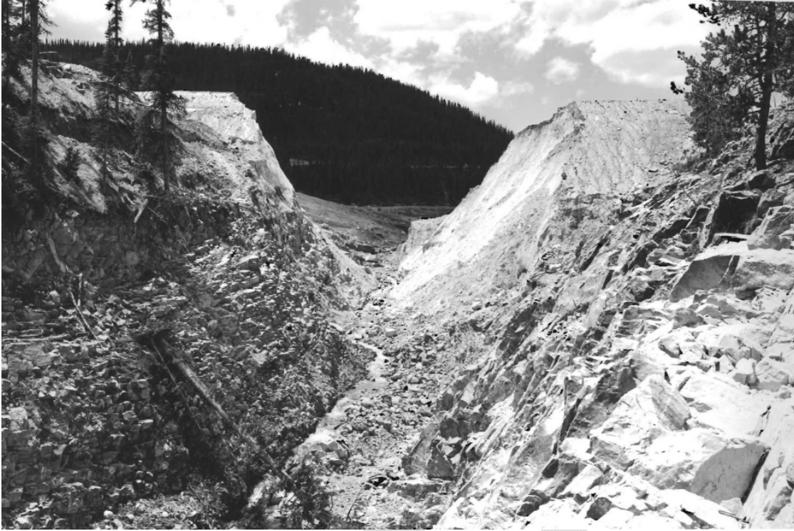
Little Deer Creek Dam, breach in maximum section

Note – an ASDSO paper (The Little Deer Creek Dam Failure, A Forensic Review of a Fatality, The Journal of Dam Safety, Winter 2004) cites an estimated breach formation time of 1 to 1.5 hours with maximum breach discharge between 14,000 and 17,000 ft 3 /s. This information is not consistent with other available reporting.