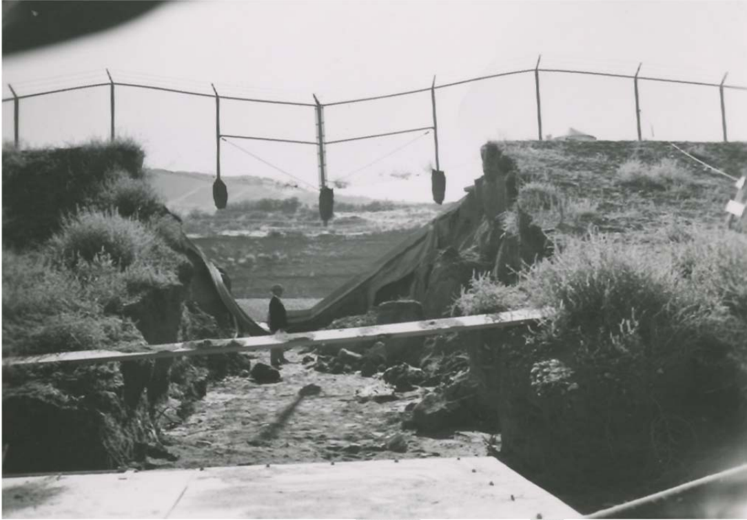
Close up of breach, Reservoir No.1 Dam Source: Earl Bud Bay, Reclamation, September 25, 1961