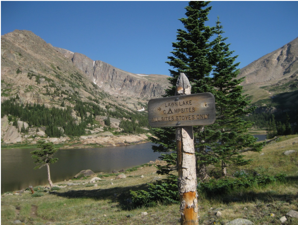
Lawn Lake, taken July 2012

Lawn Lake Dam was located at about an 11,000 foot elevation, in Rocky Mountain National Park, Colorado, just west of the town of Estes Park. Access to the dam was by way of a 6.3 mile hiking trail. The dam was an embankment structure which raised a natural lake, and stored water for irrigation. The twenty-six-foot-high dam held a reported 674 acre-feet of storage and was 79 years old at the time of its failure. Breaching of the dam was due to piping which was initiated along the outlet works conduit that ran through the embankment. Lawn Lake Dam failed at about 5:30 am, Thursday July 15, 1982.