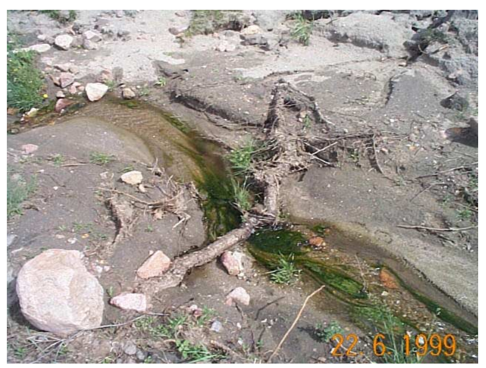
Figure 3. Large pine root located in the channel of the breach opening of a failed Air Force Academy waste lagoon pond dam (David Eyre, Senior Civil Engineer, Air Force Academy, Colorado, 1999).

Twenty-nine states indicated documented evidence where vegetation on dams has either caused dam failure or negatively affected their safe operation. Sixteen states had no documented evidence and five states had no response. Several states provided photos and information on tree-caused failures or dam safety problems. The most recent documented dam failure due to tree root penetration occurred in May 1999 at an unnamed Air Force Academy dam near Colorado Springs. Here, an approximately 13-ft. high dam with a pond capacity of less than 5 acre-feet of horse stable waste water failed, releasing its contents and injuring a horse in a stable located about 100 yards downstream. The failure occurred after more than 7 inches of rain had fallen in the previous 72 hours. The dam had several pine trees on its crest and faces, and the breach opening exposed an extensive, deep root system. Roots up to 4 inches in diameter were found in the breach area. Figure 3 shows an example of a large root exposed in the bottom of the channel at the breach. The dam had not overtopped, and the failure was attributed to internal erosion of the decomposed granite embankment material along the roots. A tree had been located directly over the breach.